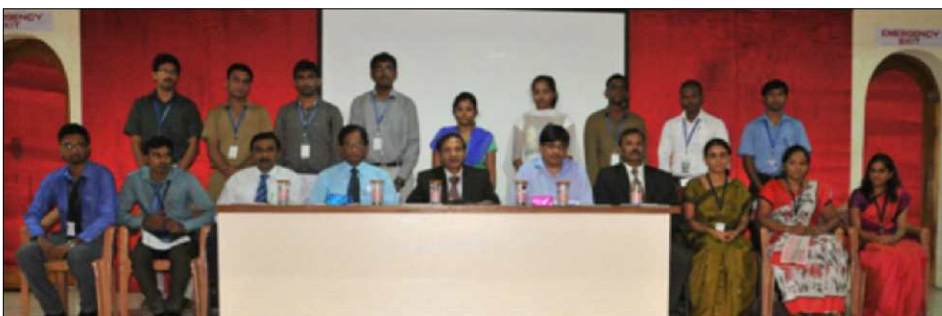
Dignitaries with Students Officer Bearers