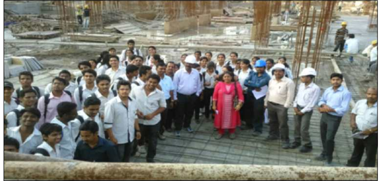
Students at Site