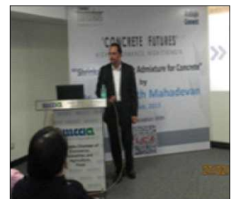
Dr. Viswanath Mahadeven addresses

informative. More than 130 people were present for the Lecture. The function ended with dinner.