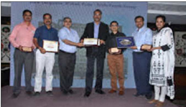
Recipients of the Award