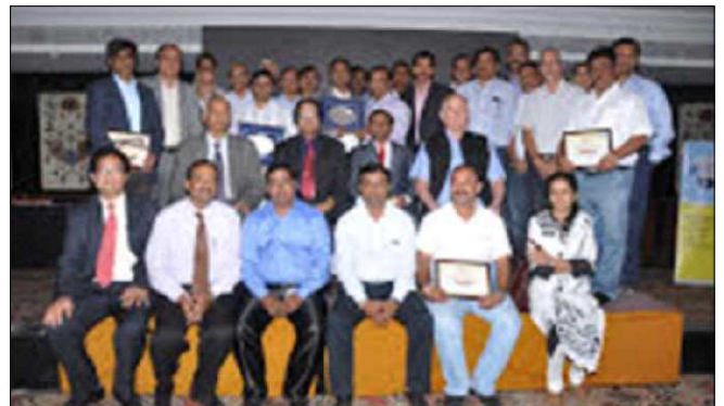
Organizers with Chief Guest