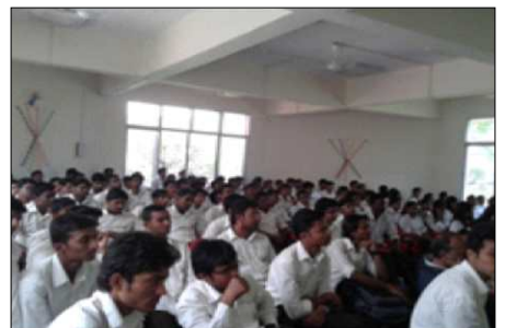
Students and Staffs attending the lecture