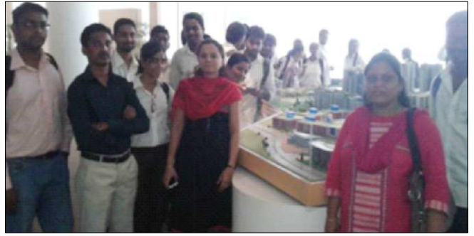
Students in the Model room

on Concrete Mix Design and working of Ready Mix Plant. He elaborated everything from storage of different ingredients to loading and unloading of transit mixers. Students visited one such plant at construction site, where construction of Raft foundation was going on. Students were able to observe the construction of Raft foundation, Retaining wall, Shear Wall, Lifts duct, column etc.