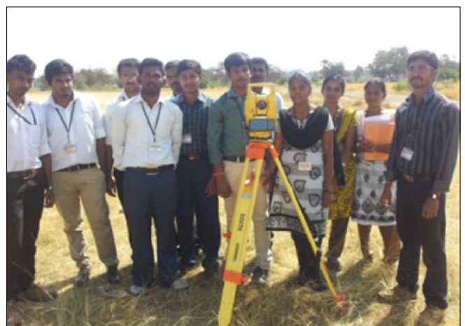
Students doing experiments at the camp

end of survey camp, students experienced the reality of surveying in the field and were benefited much to know about the latest equipments in the survey field. The students in the camp thanked the authorities of Pichandampalayam and faculty members for their guidance in the field and also expressed their sincere gratitude to the Management.