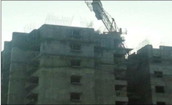
Construction of tower